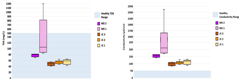
Figure 2: A box and whisker plot of TDS at each of the five sites in Jacoby Creek and Martin Slough (n=12). The healthy range of TDS for salmonids is 0-500 mg/L (Carter 2008).