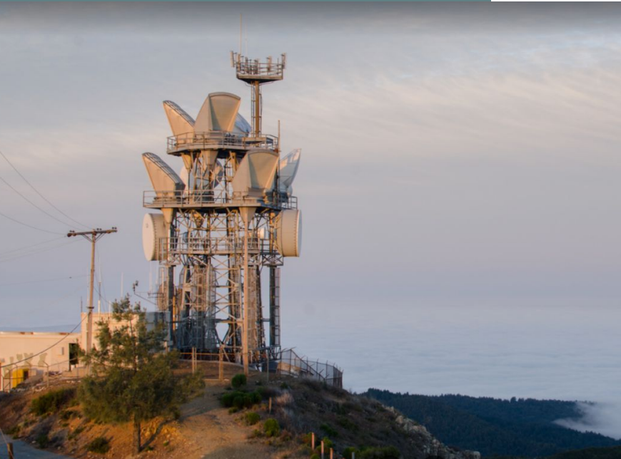
Loma Prieta